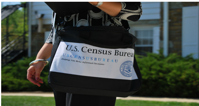
Our research improved Virginia's Census address lists

In early 2010, Demographics & Workforce research identified 4,100 housing unit addresses missing from the Census address list – which would have been left out of the 2010 census. Findings from both of these studies improved the count accuracy and representation of Virginians in the decennial census, which determines Virginia's share of funds from many federal programs and apportionment of seats in Congress.