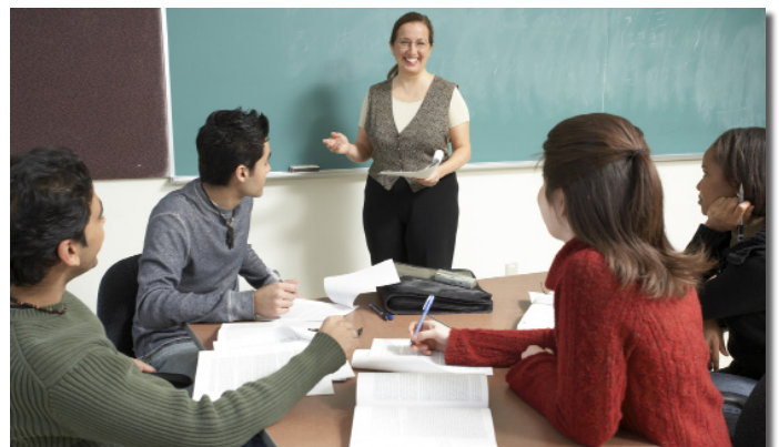
New adult literacy estimates will help efficiently distribute funds

Illiteracy in Virginia is decreasing from two decades ago, but many parts of the commonwealth continue to face