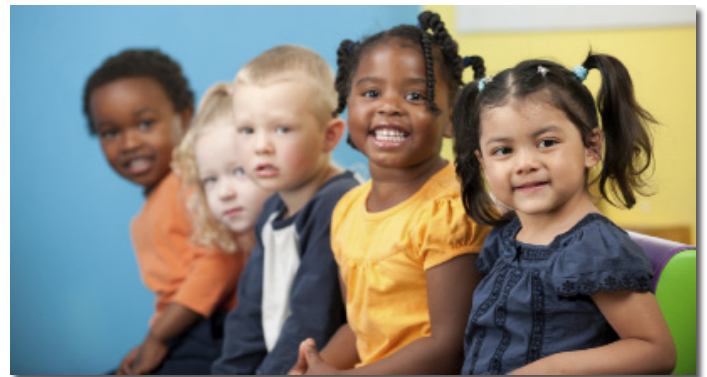
New method for estimating school-age population will save millions

By December 31st, 2010, the Census Bureau will deliver the population counts to the President for apportionment of congressional seats. Beginning in February 2011, states will receive census data for use in redistricting.