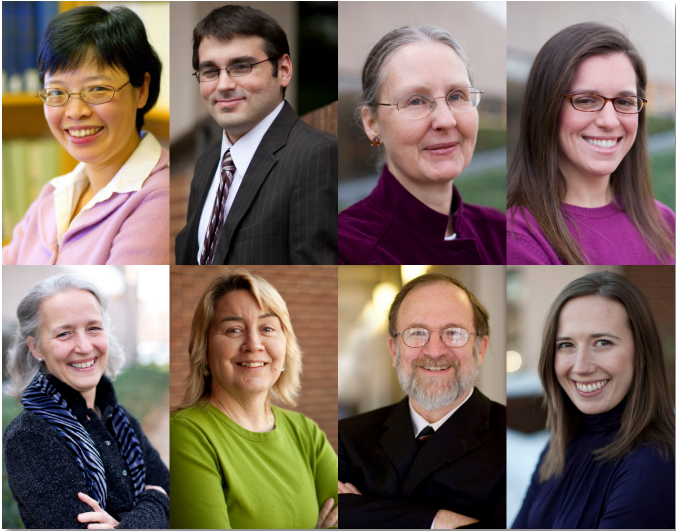
Demographics & Workforce Group Staff

Maximizing investment of state funds by providing accurate and practical data to state and local governments was the primary goal of Demographics & Workforce professionals during the past year's economic contraction and budget reductions. Research projects included: