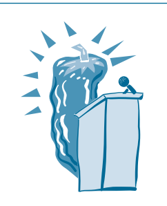
"HOT TOPIC" SEMINARS

As mandated under the federal Clean Water Act, Virginia's Stormwater Phase 2